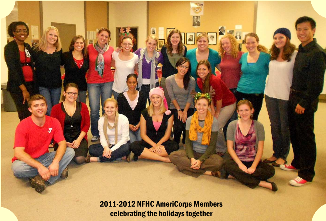
2011-2012 NFHC AmeriCorps Members celebrating the holidays together